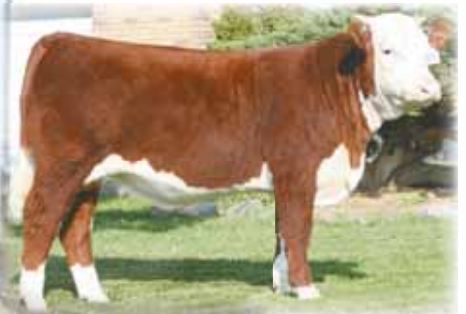
Lot 6 - BB Yankee 1009