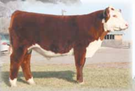
Lot 15 - BB Looker 1033