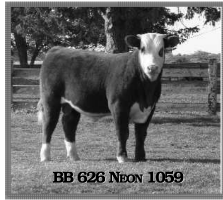
BB 626 NEON 1059