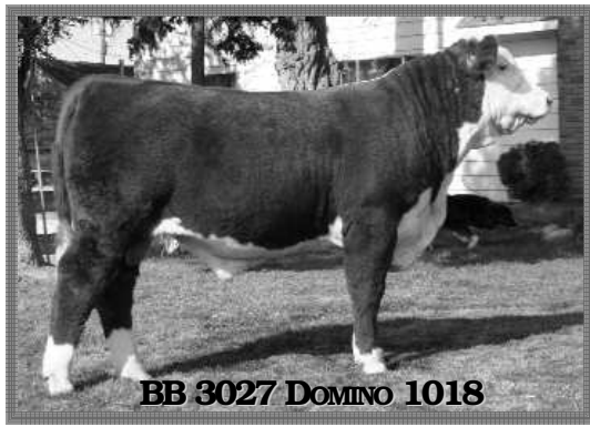
BB 3027 DOMINO 1018