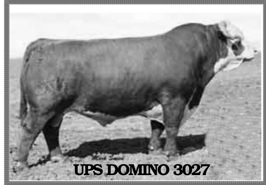
UPS DOMINO 3027