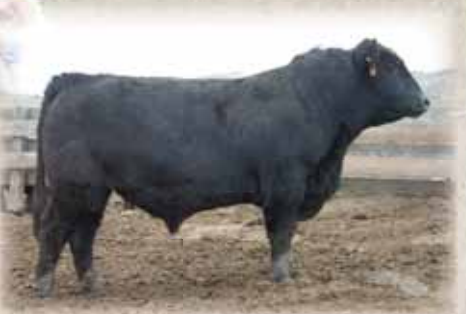
Lot 140 - BB Future Direction 0011