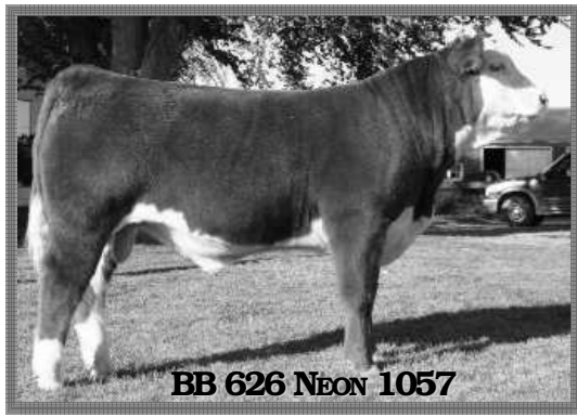
5 BB 626 NEON 1057 Calved 3-19-2011 Bull 43198750 Tattoo B1057

GH NEON 17N CHURCHILL NEON 626S 42696418 CHURCHILL LADY 346