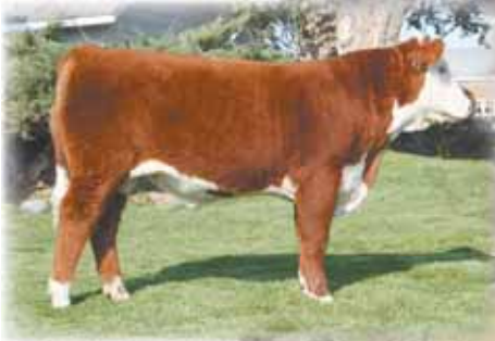
Lot 2 - BB 3027 Domino 1026