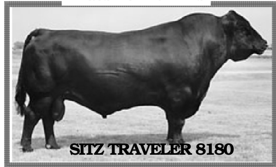
SITZ TRAVELER 8180

Lot 117-120 Here are 4 outstanding Angus calves, 2 sired by 8180 and 2 sired by Raven. These are thick, deep well made calves that we think you are really going to like.