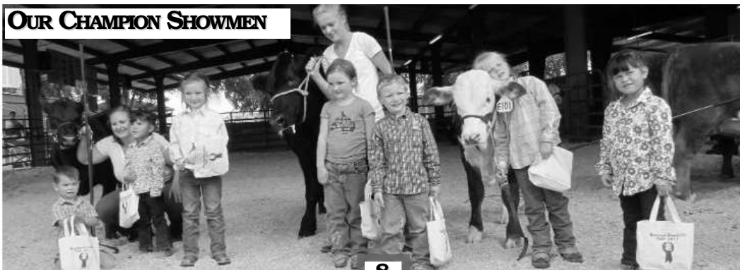
OUR CHAMPION SHOWMEN