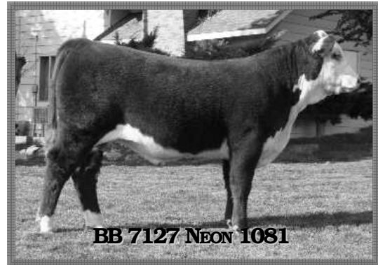
8 BB 7127 NEON 1081 Calved 3-28-2011 Bull 43198792 Tattoo B1081

B1003 is another Yankee calf that is thick and deep bodied. He has looked really good from birth. His Monument dam from a very good Mark Donald 4209 cow give him a lot of performance and carcass. He is well marked very little white make him a very attractive range bull.