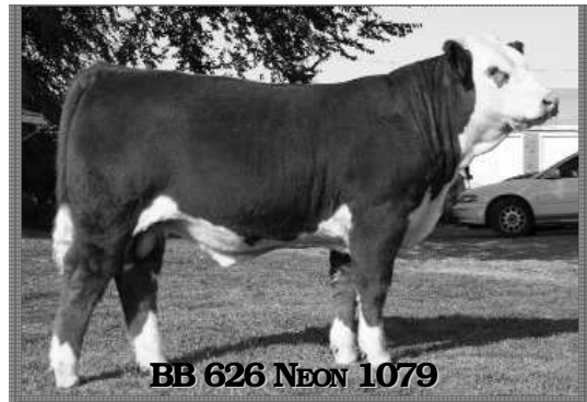
BB 626 NEON 1079