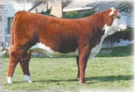
Lot 8 - BB 7127 Neon 1081