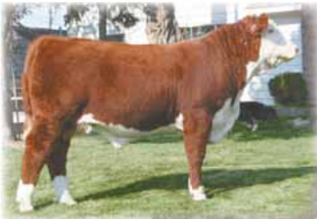
Lot 1 - BB 3027 Domino 1018