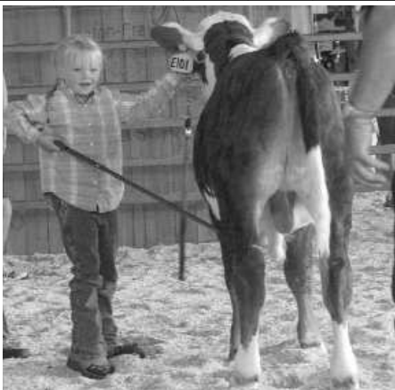
PEPPER & Hoo-D-NE (HER BRAFORD CALF)