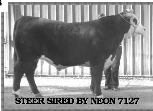
STEER Sired BY NEON 7127