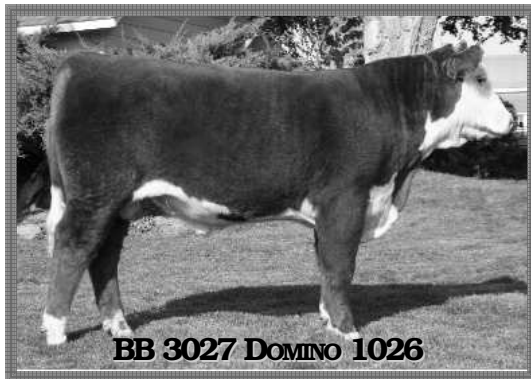
BB 3027 DOMINO 1026